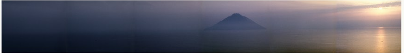
the opening shot - Stromboli seen from Basiluzzo