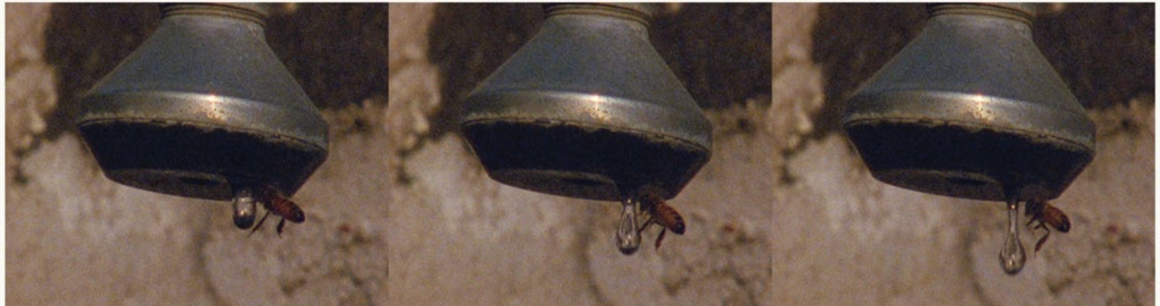
End shot of Iddu - a bee drinking from a volcano shaped shower head